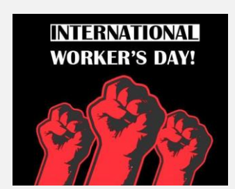
May 1, 2019 at 5:30 PM - 8:30 PM West Georgia & Richards https://tinyurl.com/y3befwbr